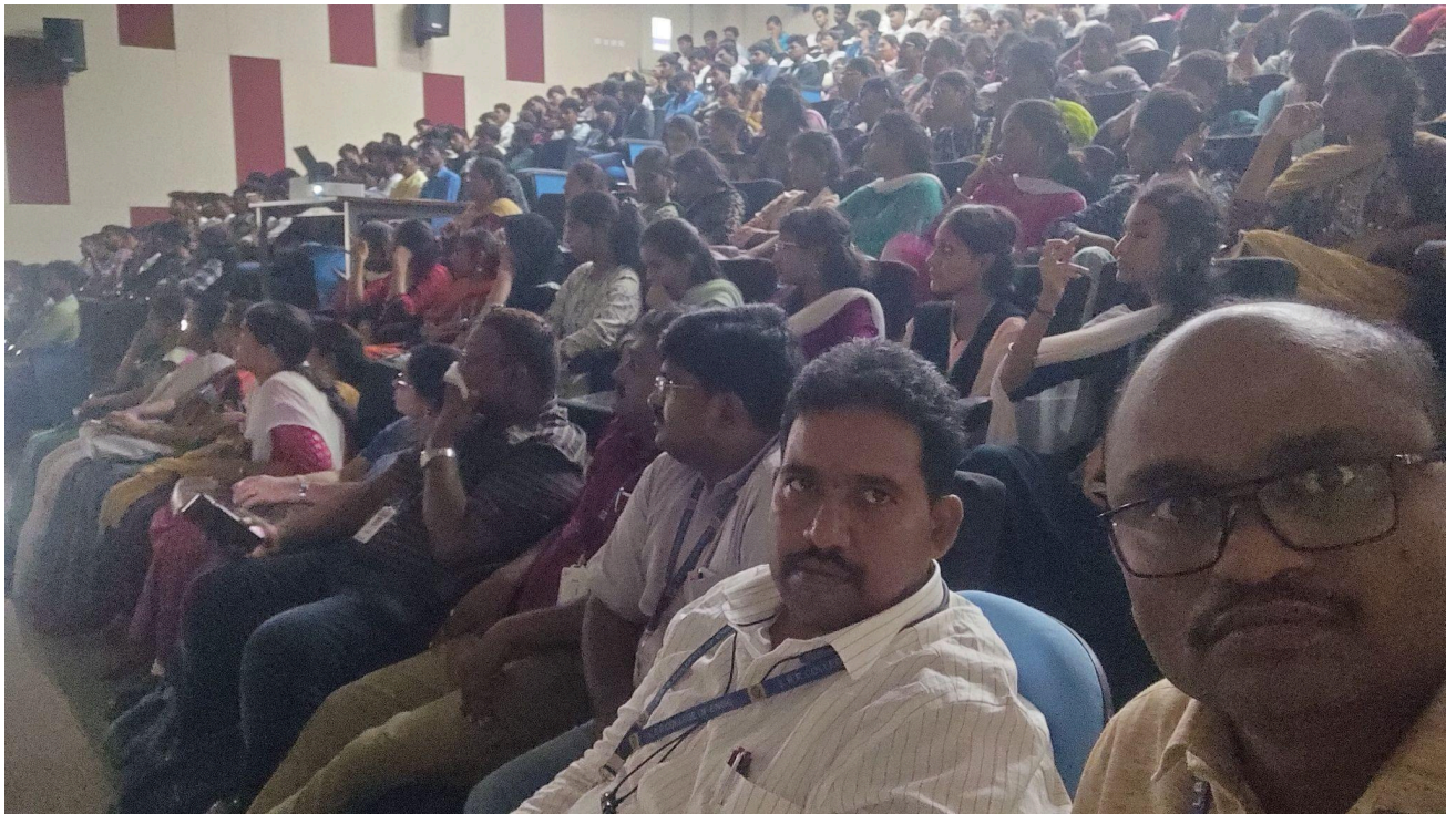
Students and Faculty listening to the lecture in the event