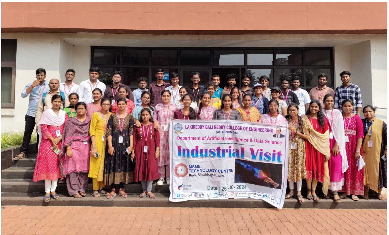
II B.Tech AI&DS Students Group Photo in front of the Auditorium of MSME